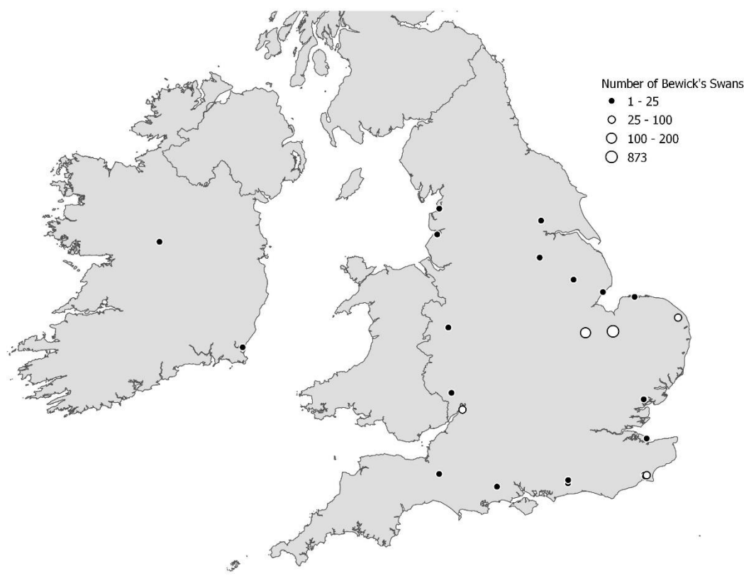
Figure 2. Number and distribution of Bewick's Swans recorded in Britain and Ireland during the International Swan Census, January 2020.

During the census, only the Ouse Washes held numbers exceeding the 1% threshold for international importance (220 individuals, Wetland International 2021), whilst WWT Slimbridge (89 birds) and Ludham Airfield, Norfolk (45 birds), each supported numbers above the national 1% threshold for Britain (44 birds, Woodward et al. 2020). No sites in Ireland supported numbers above the All-Ireland 1% threshold for national importance (20 birds, Burke et al. 2018).