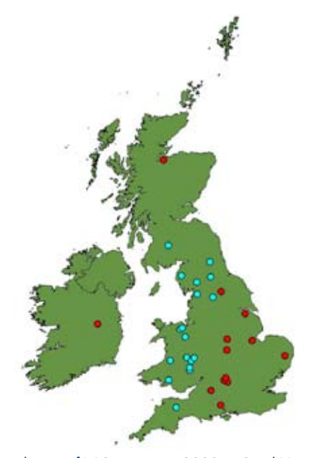
Distribution of RAS projects in 2008 on Sand Martin (red) and Pied Flycatcher (blue).

We are always keen to receive historical datasets when they complement new, or existing, projects, so if you have any data gathering dust in old notebooks or paper schedules then why not consider getting them input and submitted?